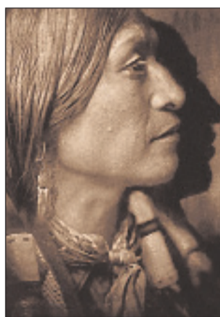
GRIPPING: Sacred Legacy, an exhibition of historical photographs of the native people of North America is now on at the Durban Art Gallery

iZulu Theatre, Sibaya 20 June Durban City Hall