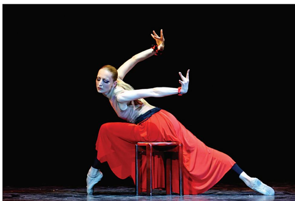
THE RUSSIANS ARE COMING: The Bolshoi Ballet will be performing at the Playhouse Opera theatre on 7 March

Tickets: R150, includes buffet Call: 031 328 8068