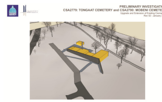
30 Mobeni - Massing (Big)